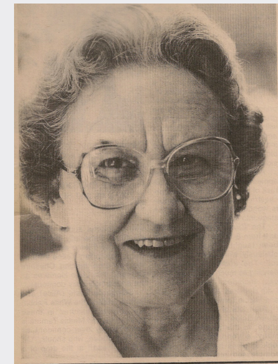
"Children get a glamorized version of professional life from television and advertising, so we try to balance that by giving them an opportunity to speak to successful women firsthand. Hopefully, they get the idea that success is earned through hard work and by staying in school."