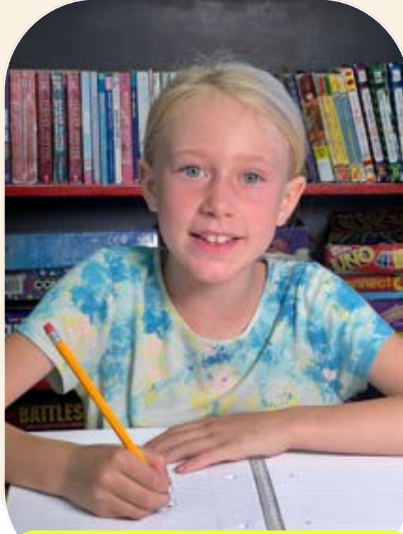
Words in Play