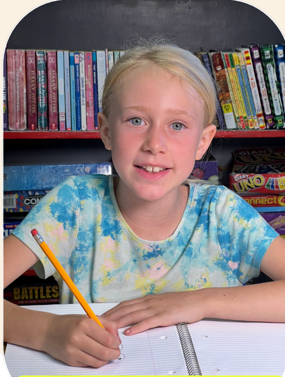
Words in Play