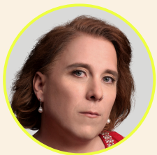
AMY SCHNEIDER Jeopardy champion, powerful advocate for trans youth and the LGBTQ+ community, writer