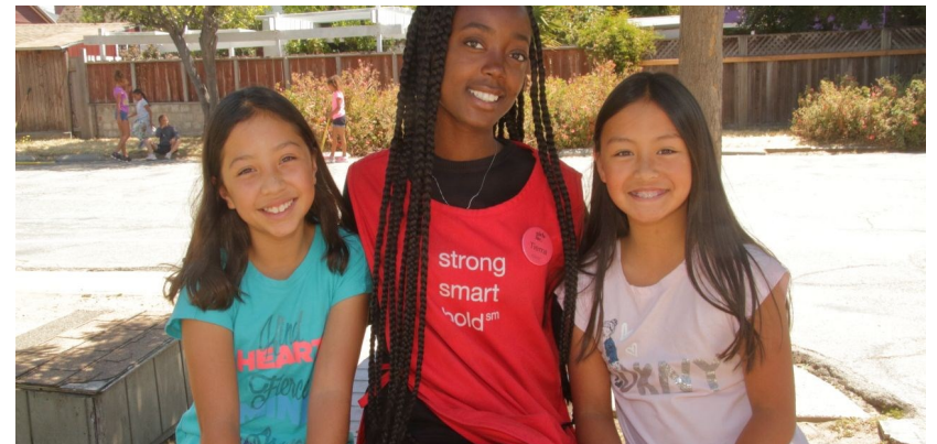
Strong, Smart, and Bold SM Girls