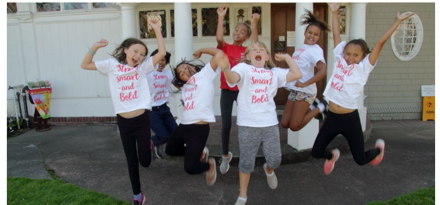
Make new friends!