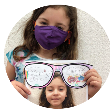
Meyers Center opened up to a small group of girls, many from families of essential workers.

IN-PERSON PROGRAMMING helped meet the needs of the families of essential workers.