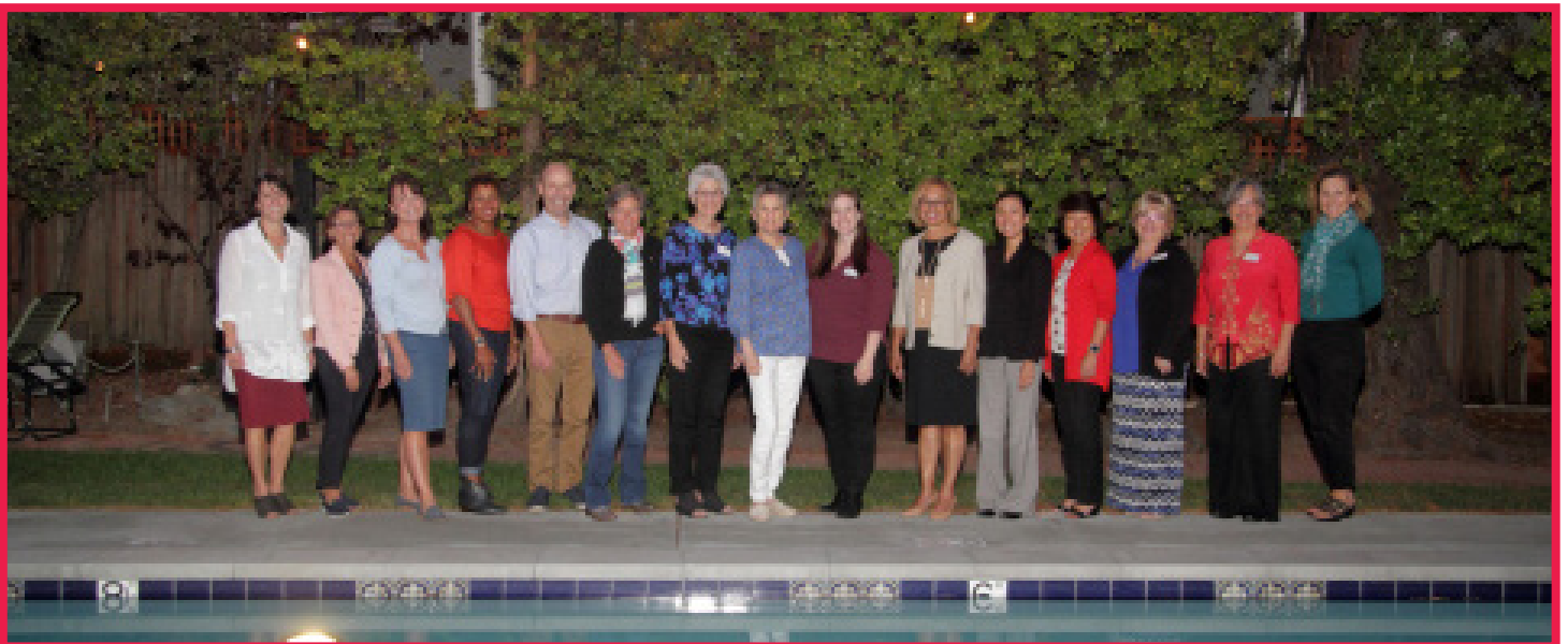
2019 Board Installation Ceremony