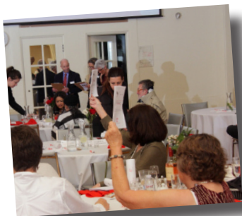
Women Who Dare Luncheon - 2017