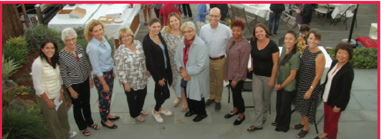
2018 - 2019 Board Installation Ceremony