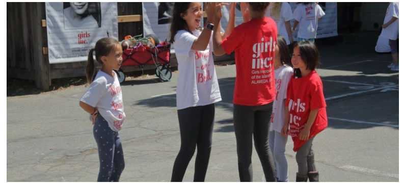
Weekly Themes and Awesome Field Trips!

Contact the Teen Department at 510-521-1743 ext. 208, or check out our website, www.girlsincislandcity.org to find out more information!