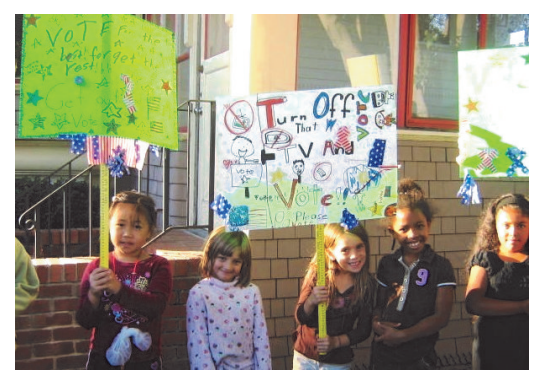
Girls participate in She Votes!

Non-Profit Org. U.S. Postage PAID Permit #40 Alameda, CA